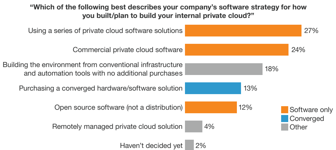
FIGURE 1 Software Suites Represent The Most Common Approach To Private Cloud

Base: 748 global hardware decision-makers who work with servers, storage, or the data center and are planning/implemented private cloud (1,000+ employees)