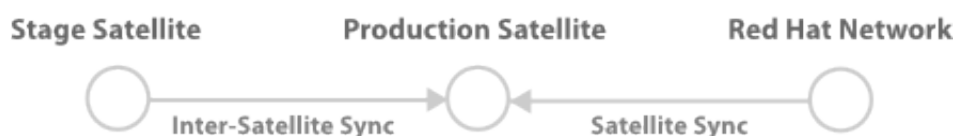
Figure 4. Syncing from RHN Hosted and a Satellite Staging Server

For example, a production Satellite Server normally syncs directly from RHN Hosted servers for content updates, but will occasionally sync production-ready information from a RHN Satellite development server.