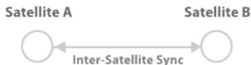
Figure 5. Bi-directional syncing

Administrators can configure an environment where two RHN Satellite servers act as masters of each other. For example, Satellite A and B can sync content from one another.